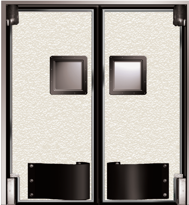
Picture shown is PT-9100V it has an optional 14" x 16" vision panel and 18" high teardrop bumpers.